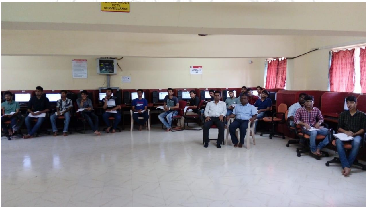
(BE Mech students learning the PLC Programming and SCADA session)

The course has been approved under the Government of India's National Skill Development Corporation (NSDC). The course fees for all 70 students have been completely sponsored by BMCET under its mission to impart technical value added skills to the students. The students